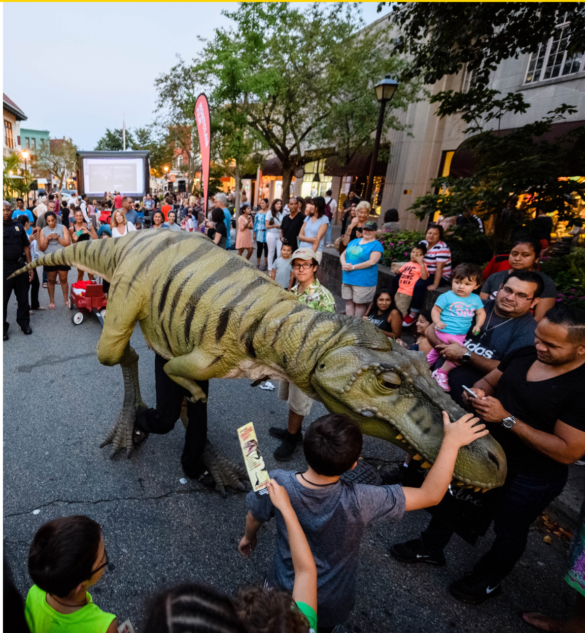
A T-Rex visited the audience during our screening of Jurassic Park!

Montclair Film's popular Summer Series of free outdoor screenings in public parks and downtown streets has become a favorite and affordable summertime "staycation" activity for families and audiences of all ages.