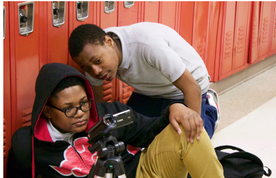
East Orange High School Filmmaking Workshop