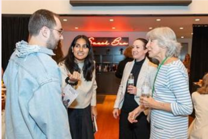
FILMMAKER BREAKFAST Co-Presented by Shine Global