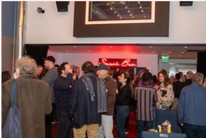
INDUSTRY PARTY Co-Presented by Skopos Catering