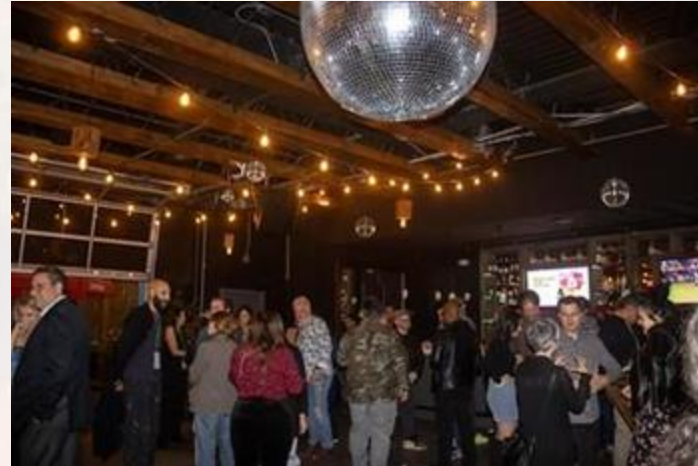
FILMMAKER PARTY Co-Presented by Porta