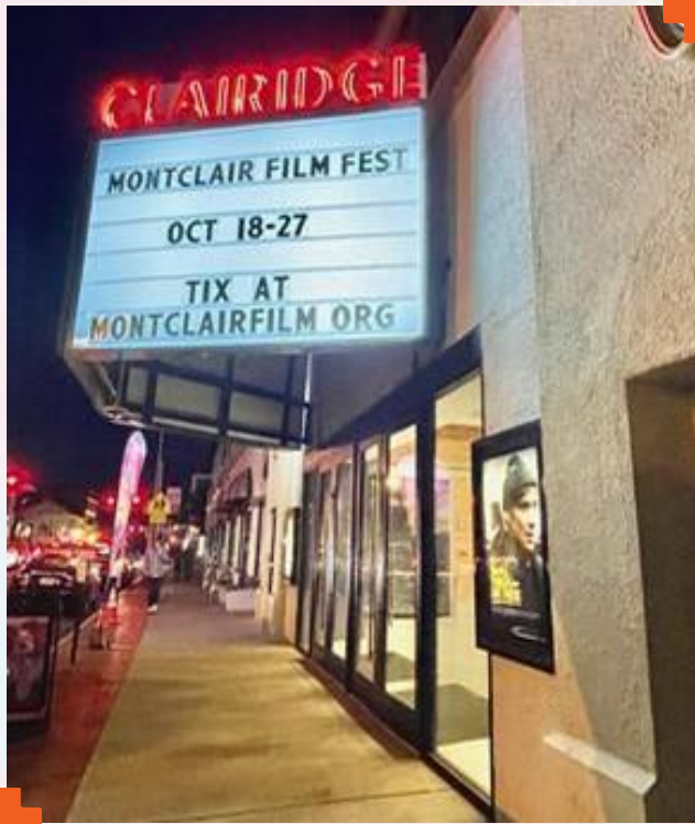
The Clairidge is a Montclair Film Nonprofit Cinema