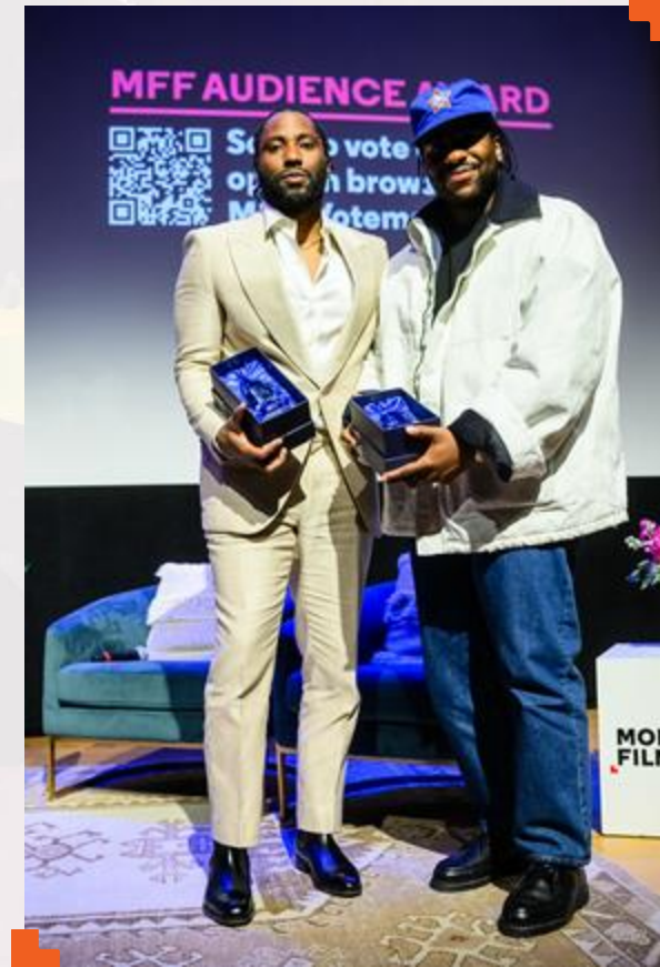
2024 Breakthrough Director: Malcolm Washington 2024 Performance Award: John David Washington