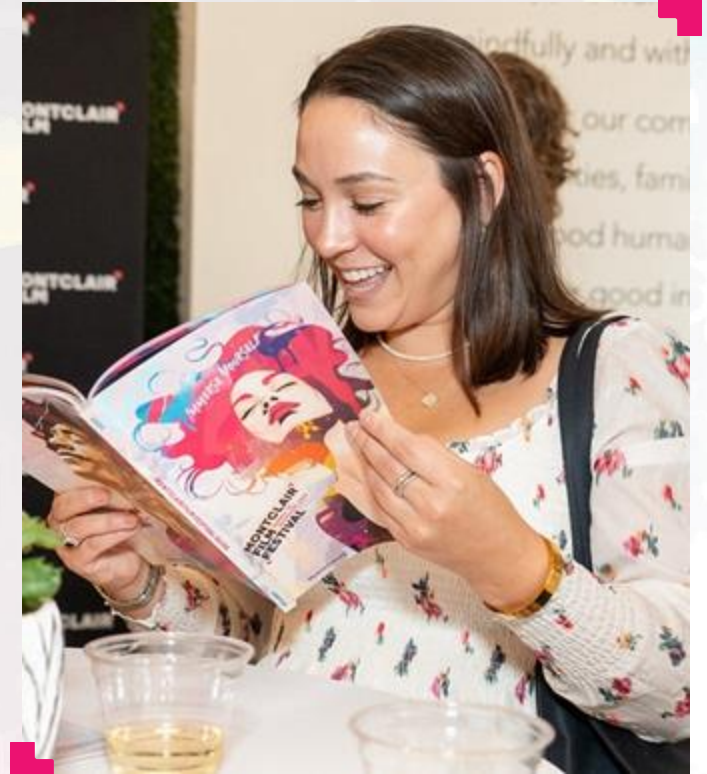
Co-presented with Loopwell and Skopos Catering