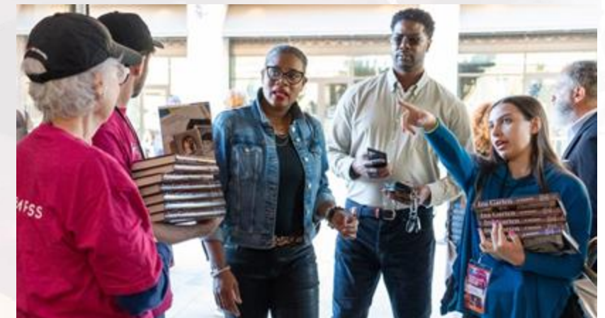
Be Ready When The Luck Happens: A Memoir Copies provided by Watchung Booksellers

MONTCLAIR FILM October 18 – FESTIVAL October 27, 2024