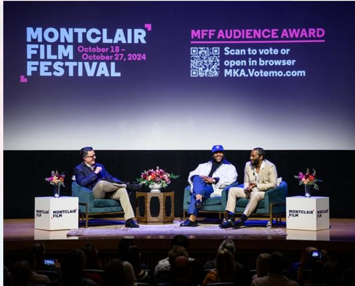
Audible Storyteller Series: Q&A with Malcolm and John David Washington with Stephen Colbert