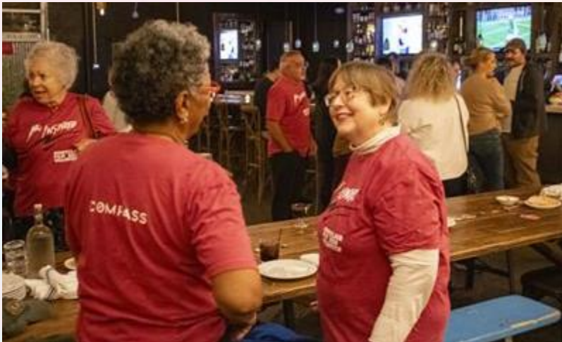
Volunteer Appreciation Party at Porta