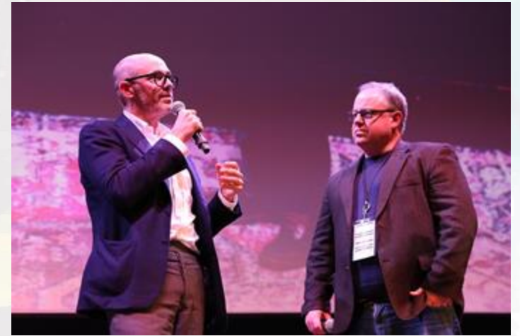
Q&A with Director Edward Berger