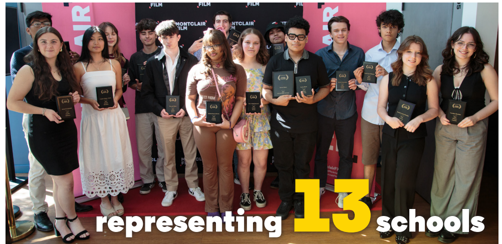
2025 Emerging Screenwriter Competition winners

A statewide competition that honors the creativity and storytelling power of young screenwriters, culminating in a professional live reading of finalist scripts by professional actors.