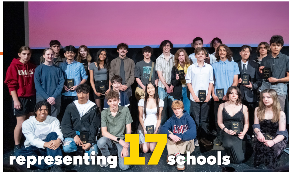
2025 Emerging Filmmaker Competition winners

An inspiring red carpet event juried by industry professionals that showcases the vision and originality of student filmmakers from across New Jersey.